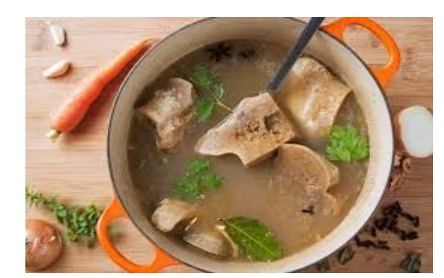
Bone Broth is popular and excellent for gut healing!

The Ranch is non-certified organic & biodynamic. All beef is raised with love & respect and anointed with essential oils before butchering. Quarter Beef $650—$750, Steaks, Ground Beef, Stew Cuts, and more are available as individual packages. All meat is processed at a USDA Organic Facility. We will have Highland and Black Angus this year. Call for more details! (989)506-0057