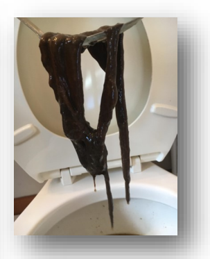
Yes.... We Really Have Passed Them!!!